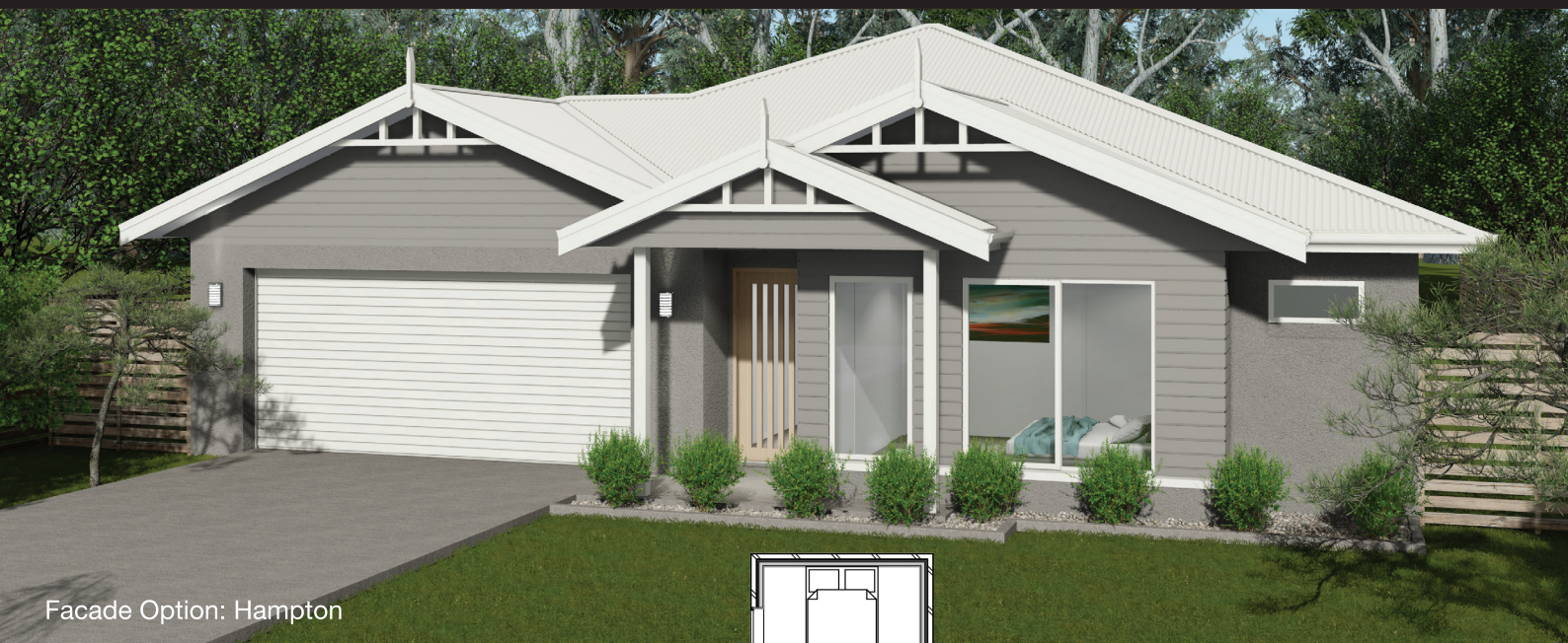
Facade Option: Hampton