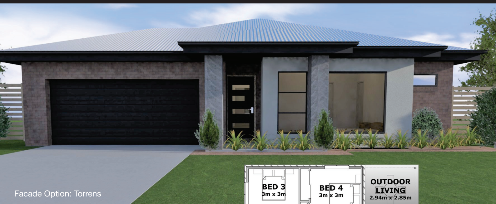
Facade Option: Torrens