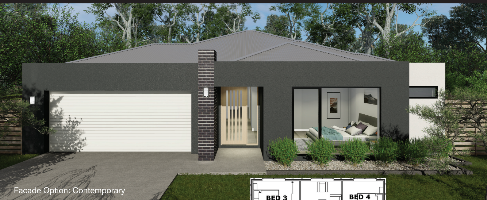
Facade Option: Contemporary