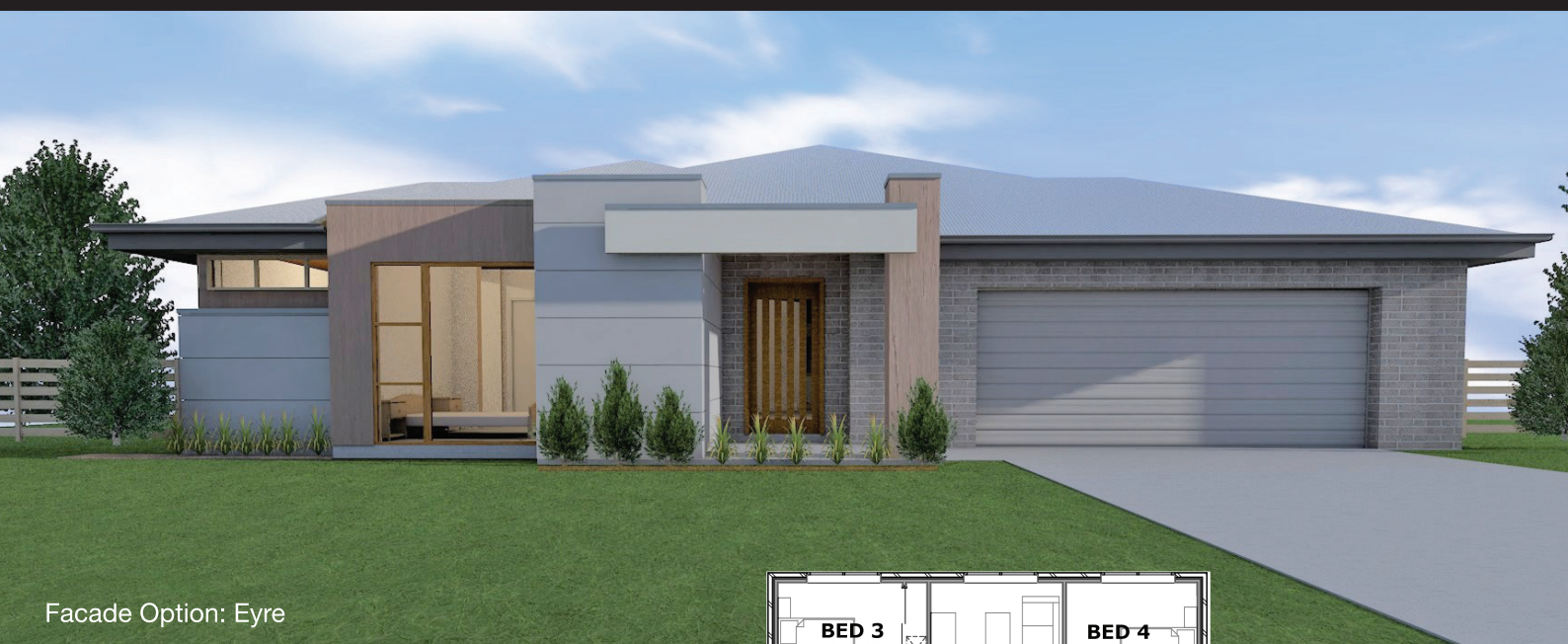
Facade Option: Eyre