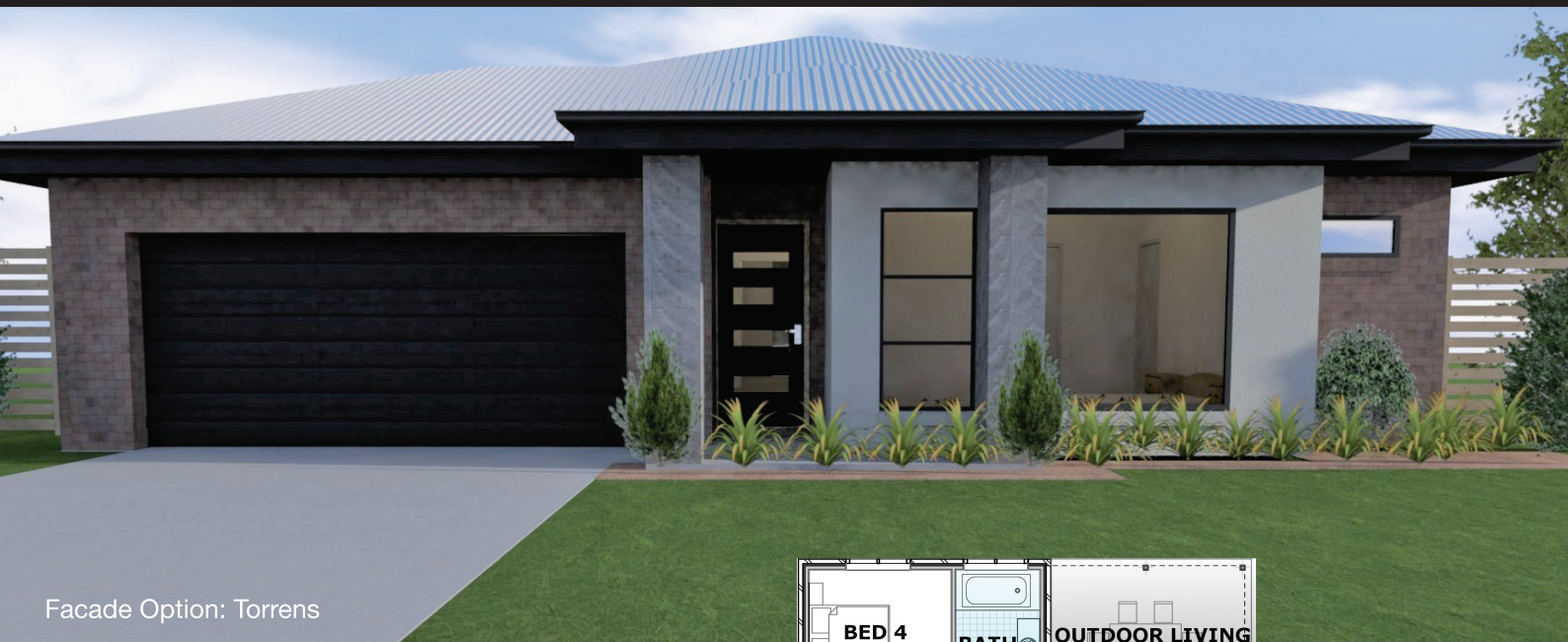
Facade Option: Torrens