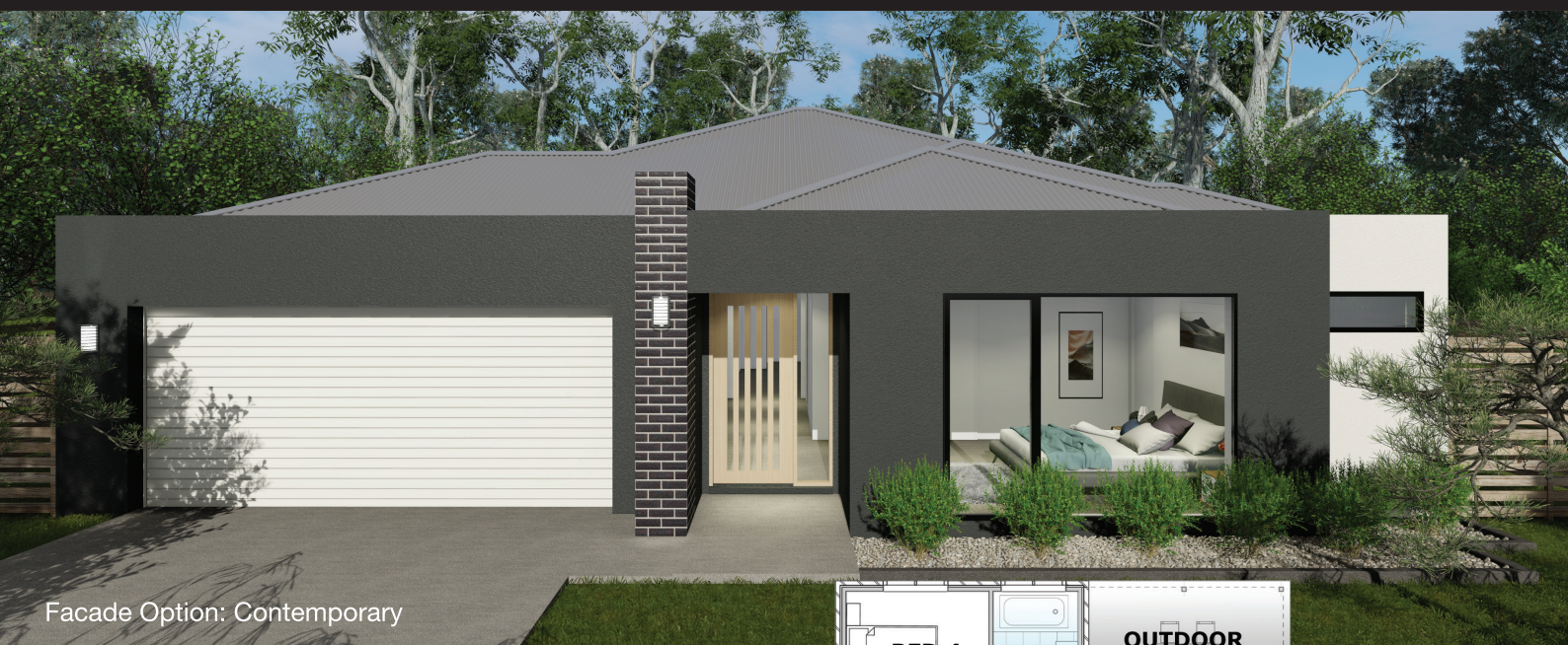
Facade Option: Contemporary